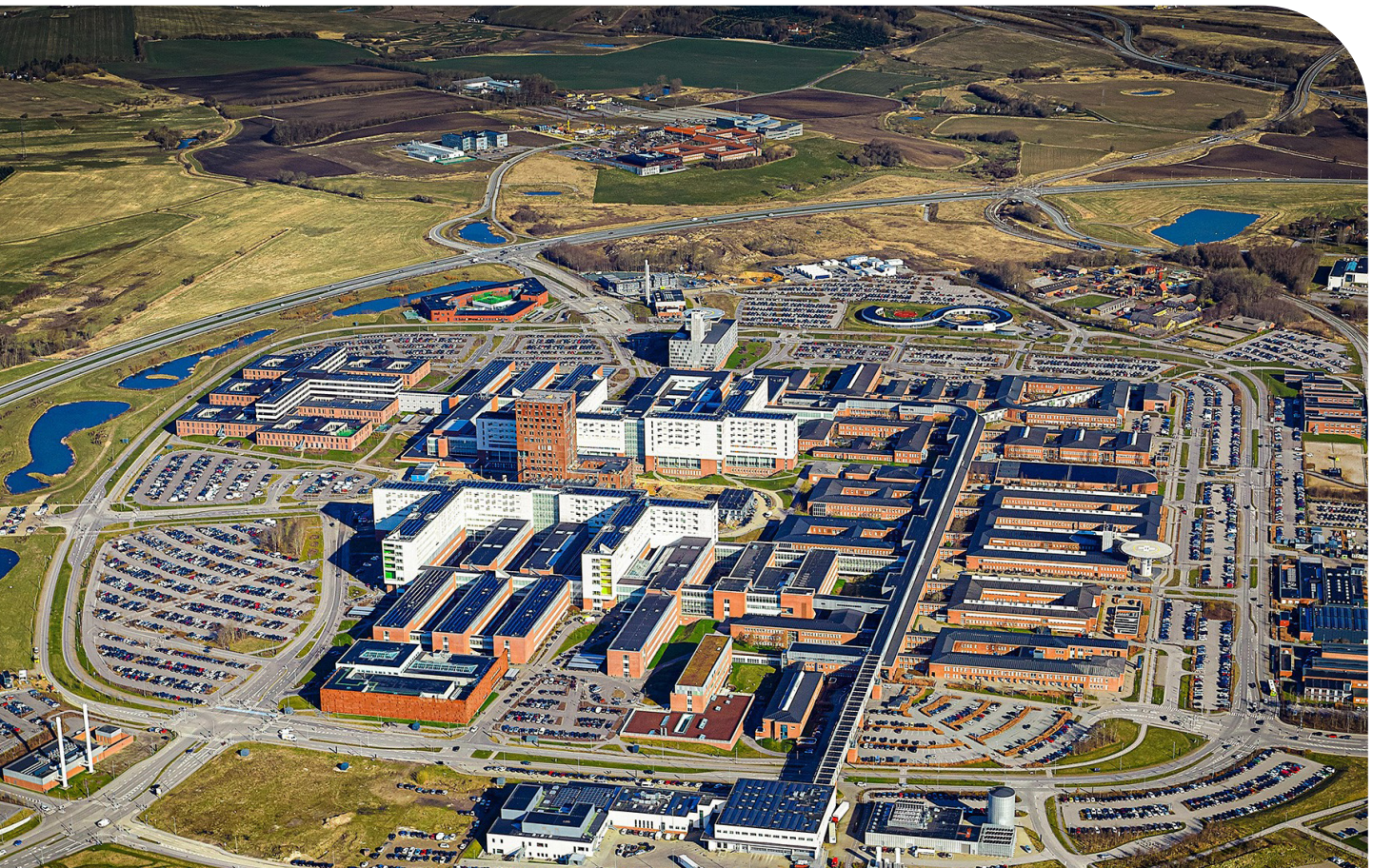
DNU - Det Nye Universitetshospital (today named Aarhus University Hospital)